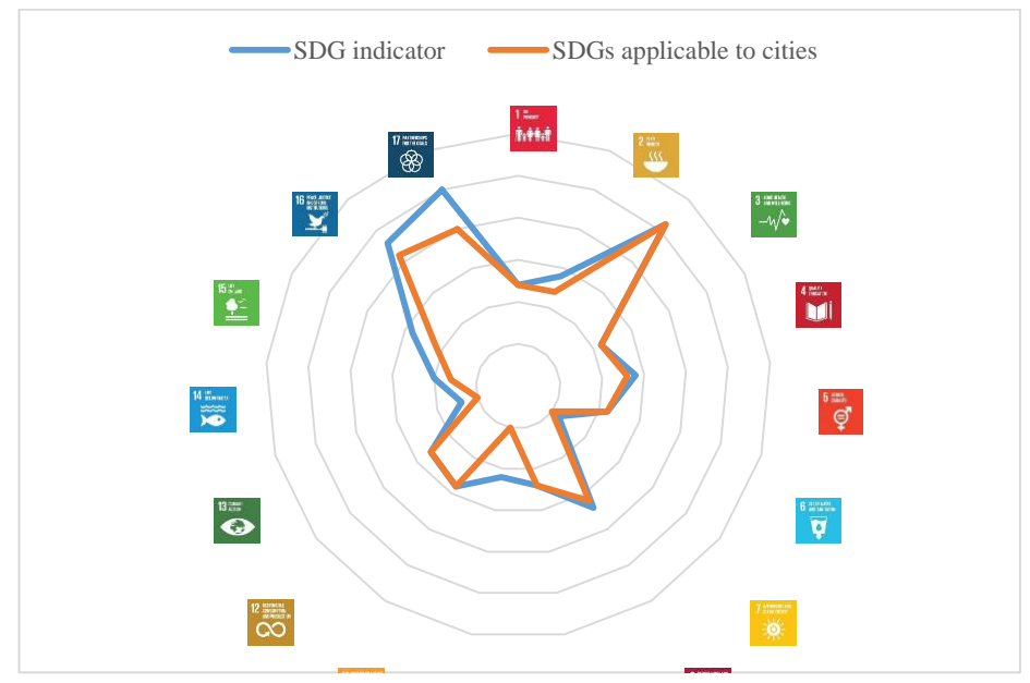
Figure 2: Comparison of SDG indicators and their relevance in a local context

One of the SGDs, goal 11, is specifically addressing cities and human settlements, setting the target to make them inclusive, safe, resilient and sustainable. This is the result of experiences with the implementation of the millennium goals as well as the lobbying to recognise cities as an important driver for transformation as well as the importance of a bottom-up approach for global change (UCLG, 2015) ("SDGs: Sustainable Development Knowledge Platform," n.d.). Despite a specific goal focusing on the urban perspective, all goals are relevant for cities, and so are their respective indicators. Of the 239 indicators 215 are considered to be relevant on local level, see Figure 2 below.