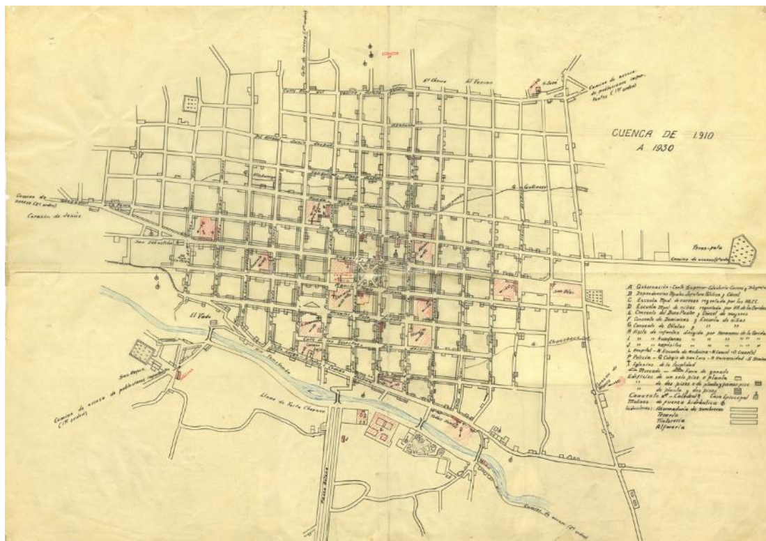
Figure 3. Map of Cuenca, 1930.

inhabiting of the city changed (Carpio, 1976). In this period, the river was perceived by people as a means of sanitation of the city, sewage was transported by canals passing through the streets and flowed into the Tomebamba river (Vega, 1997). In addition, the height and abundant river flow were used by the population for productive purposes (Morales, 2011). From colonial times until the first decades of the twentieth century, the mills on the banks of the Tomebamba River started emerging and gaining importance in grinding wheat for flour production. The banks were not considered as public spaces for leisure and recreation, yet close to them, on the south bank of the river, facilities such as the hospital, the morgue and the nursing home, all of them public, had been installed (Albornoz, 2008). In this same bank the slaughterhouse had been built and used the river for the evacuation of its waste (Jamieson, 2003).