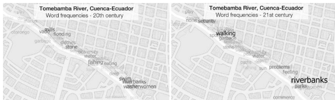
Figure 2: Comparison between mid-twentieth century and early twenty-first century.

In-depth interviews offer another look at the changes in the uses and perceptions that have occurred in the Tomebamba River over time. Keyword counts were made on the transcriptions of the interviews using Atlas.ti that revealed diachronic differences in the relationships of citizens with the river. One hundred keywords that relate to four dimensions of the study were selected: uses of the Tomebamba river (26 words), perceptions (42 words), natural environment (11 words), and built environment (21 words). Different variations of these words between interviews that referred to the mid-twentieth century and the twenty-first century were recorded based on their relative frequency. As seen in Figure 2, there are differences in the presence of words in the two analysed historical moments.