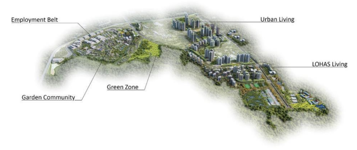
Figure 1: Proposed Yuen Long south development