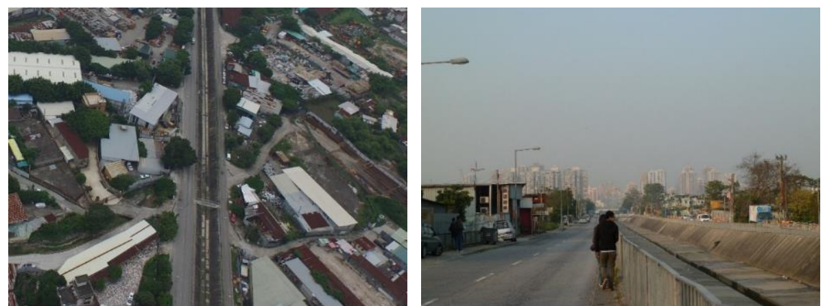
Figure 2: Photos of existing Yuen Long Nullah

There are existing drainage channels that run through the Study Area. Whilst they serve the important function of providing land drainage and flood protection for the immediate and upstream catchments, their alignment dissect the local community and affect the traffic circulation. Their concrete-lined surfaces are not appealing to the public as illustrated by the photos in Figure 2. There have been strong requests from some public to deck the drainage channels to provide space for improving the existing road network.