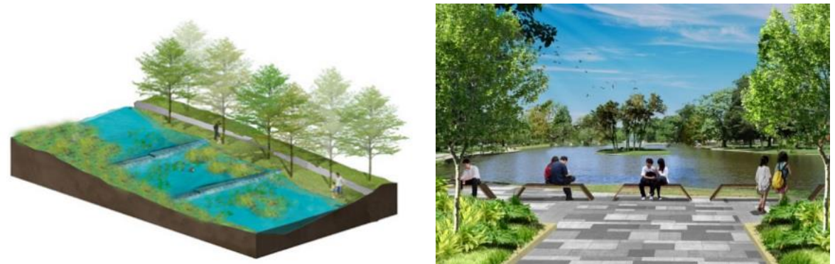
Figure 5: Photomontage of the riverside channel and retention lake

To build better resilience for climate change impacts, the design of the hillside river and retention lake has also considered impacts of increased rainfall intensities, which will generate additional surface runoff from YLS development and the existing drainage catchment. Areas have therefore been reserved adjacent to the retention lake. In the future, the retention lake can be further enlarged to provide additional storage volume.