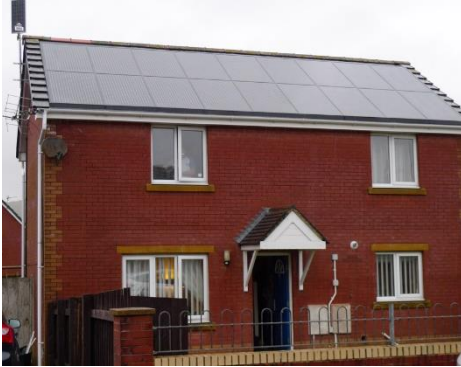
2000s built, 3-bed semi-detached