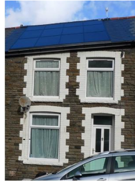
Pre-1919, 2-bed mid-terrace